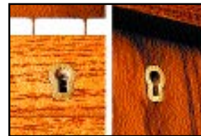
Lid and Key Cover Lock