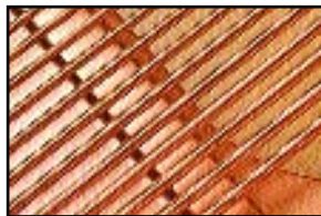
Mapes (USA) International Gold Series Strings for Singing Tone