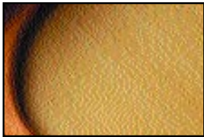
Solid Siberian Spruce Soundboard for Superior Tone Quality