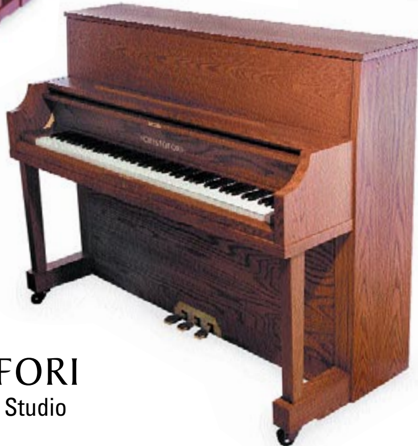
CRISTOFORI CRV460SP 46" Studio