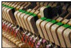
German Hornbeam Action Parts for Superior Tensile Strength, Precision and Durability