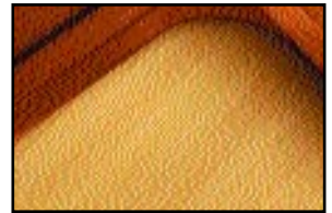
Solid Spruce Soundboard from Siberia