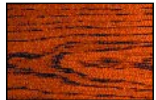
Selected Woods/Veneers from Germany and USA