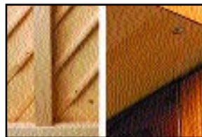
Spruce Backposts and Laminated Maple Keybed for Structural Rigidity