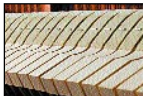
Custom Designed, Double-felted, Reinforced Hammers Made of Highest Quality Japanese Felt