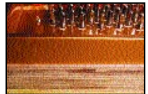
Quarter-sawn, Hard Rock Maple Pinblock for Superior Gripping Power