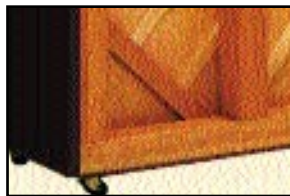
Soundboard Cut-Offs in Bass and Treble for Clearer Sound