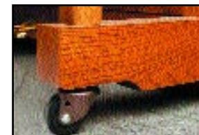
Toe-blocks for Easy Moving