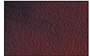
Selected Woods/Veneers from Germany and USA