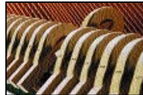
Hammer Felt from Japan