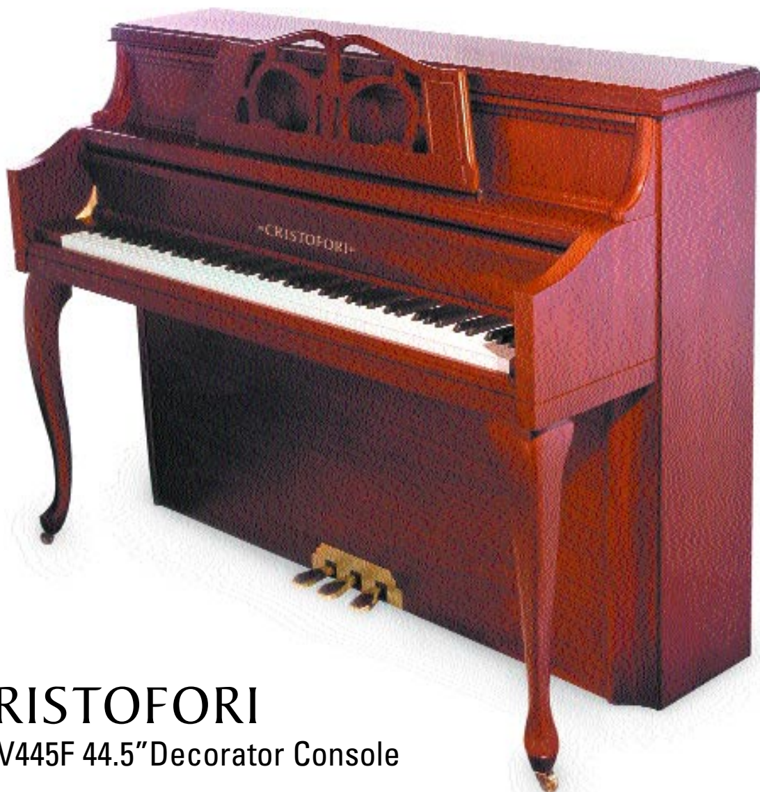
CRISTOFORI CRV445F 44.5" Decorator Console