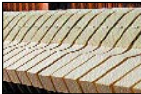
Custom Designed, Double-felted, Reinforced Hammers Made of Highest Quality Japanese Felt