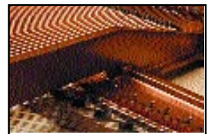
Japanese and Korean Machinery for Precision Manufacturing