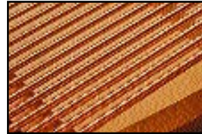
Mapes Strings from USA