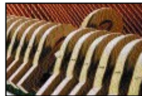
Hammer Felt from Japan