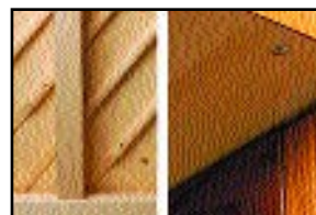
Spruce Backposts and Laminated Maple Keybed for Structural Rigidity