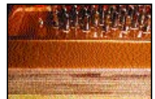
Quarter-sawn, Hard Rock Maple Pinblock for Superior Gripping Power