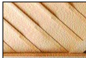
Ribs Notched into Liner for Soundboard Crown Retention