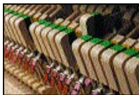
German Hornbeam Action Parts for Superior Tensile Strength, Precision and Durability