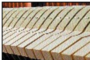
Custom Designed, Double-felted, Reinforced Hammers Made of Highest Quality Japanese Felt