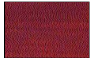
Selected Woods/Veneers from Germany and USA