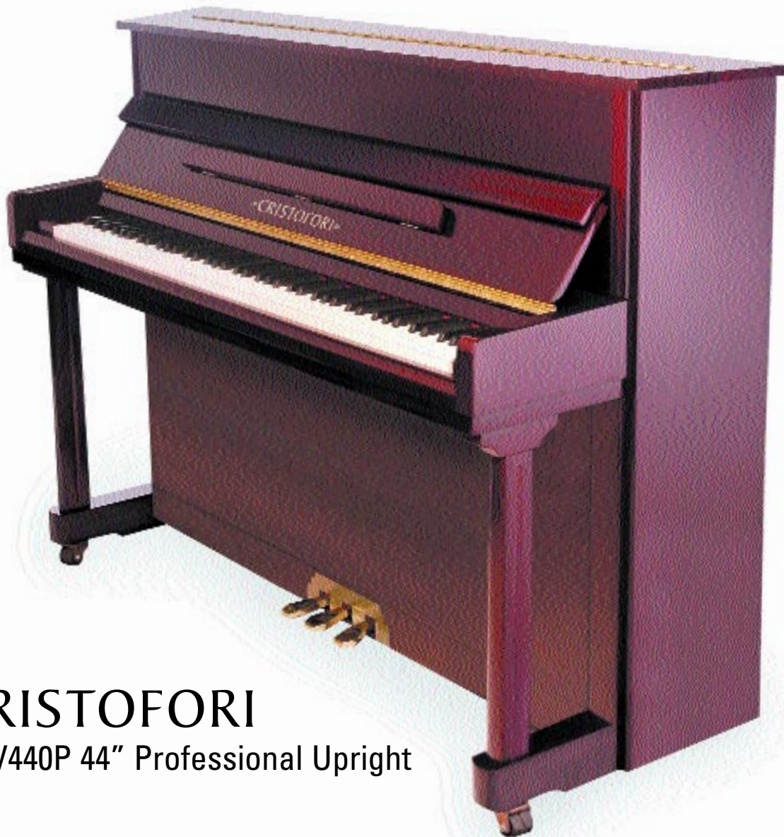
CRISTOFORI CRV440P 44" Professional Upright