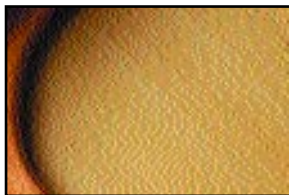
All Siberian Spruce Soundboard for Superior Tone Quality