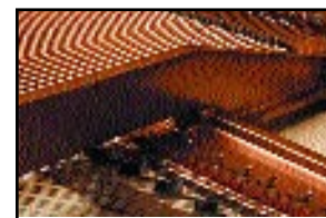
Japanese and Korean Machinery for Precision Manufacturing