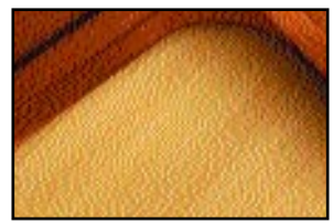
All Spruce Soundboard from Siberia