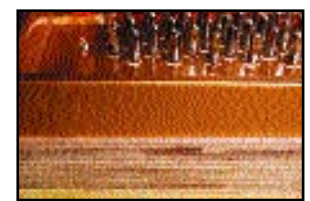
Quarter-sawn, Hard Rock Maple Pinblock for Superior Gripping Power