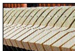
Custom Designed, Double-felted, Reinforced Hammers Made of Highest Quality Japanese Felt