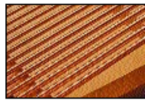
Mapes Strings from USA