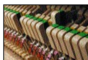
German Hornbeam Action Parts for Superior Tensile Strength, Precision and Durability