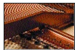
Japanese and Korean Machinery for Precision Manufacturing