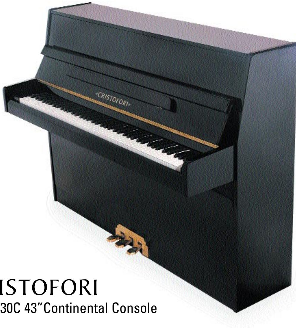
CRISTOFORI CRV430C 43" Continental Console