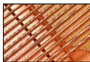
Mapes (USA) International Gold Series Strings for Singing Tone