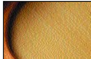
All Siberian Spruce Soundboard for Superior Tone Quality