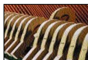
Hammer Felt from Japan